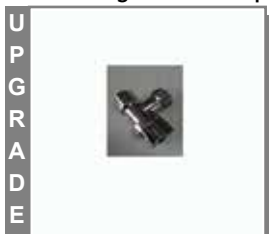
Washing Machine Stops

Spec 1 - Brewers - 20MM WASHING MACHINE STOP - MWMSC