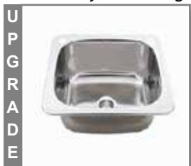
Laundry Inset Trough

Joinery - 71245 TROUGH-NUGLEAM BENCHLINE INSET 45L S/S