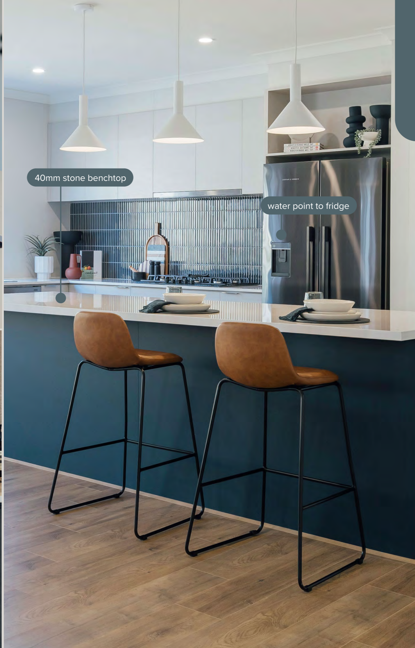
water point to fridge