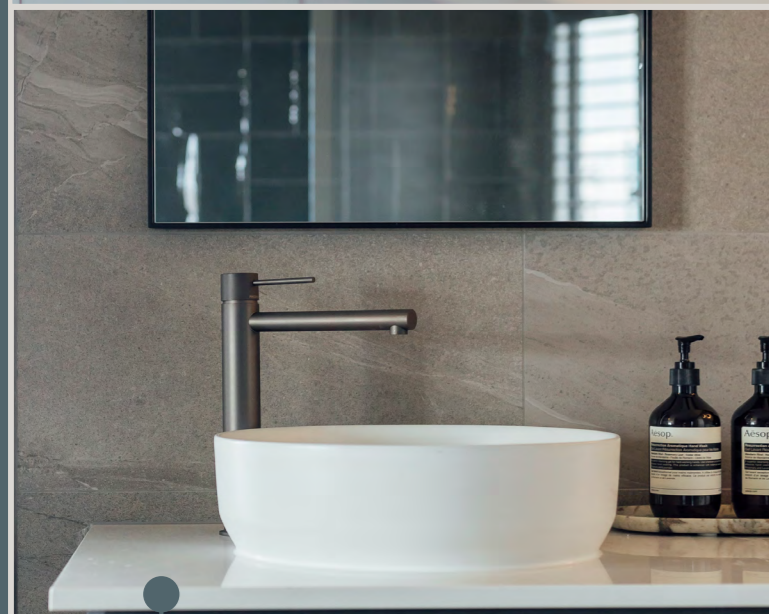
20mm stone benchtop in bathrooms