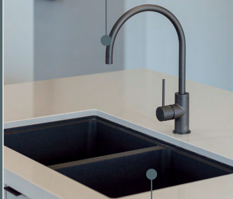
double bowl undermount sink